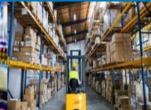
Material Handling and Logistics