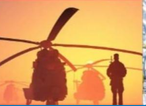
Defense Equipment Mfrs.