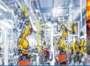
Engineering (Incl. & Automation)