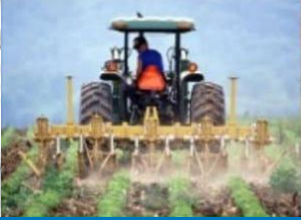
Agriculture (Farm Equipments)