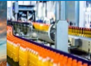
Food & Beverages Production