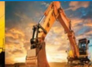
Construction & Mining Equipment