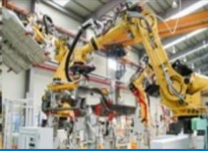
Motion & Drives